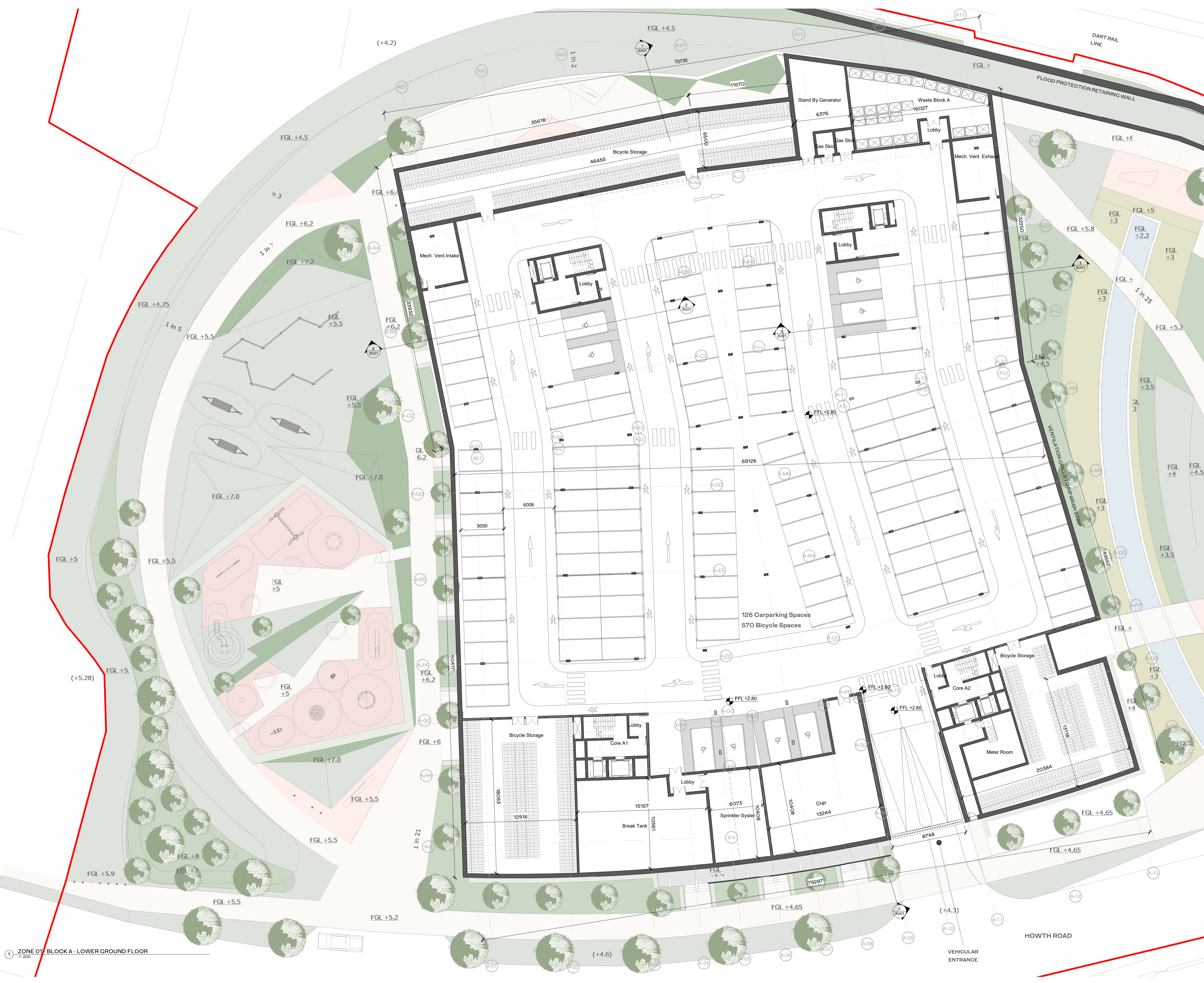
1 ZONE 01 - BLOCK A - LOWER GROUND FLOOR 1:200

Henry J Lyons Architecture + Interiors +353 1 888 3333 info@henryjlyons.com 53-54 Pearse Street Dublin D02 K466